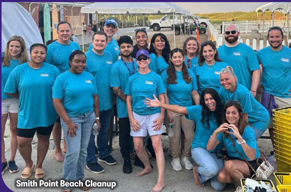
Smith Point Beach Cleanup