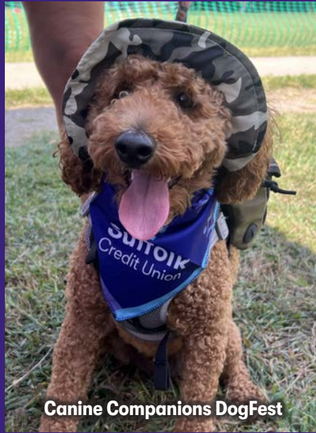
Canine Companions DogFest