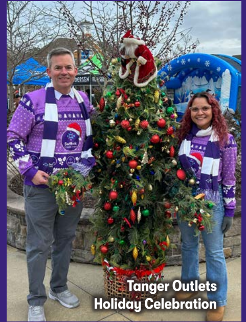
Tanger Outlets Holiday Celebration